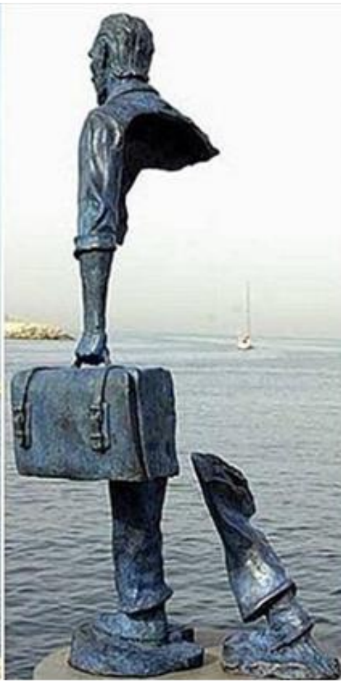
This statue, created by Bruno Catalano, is located in France