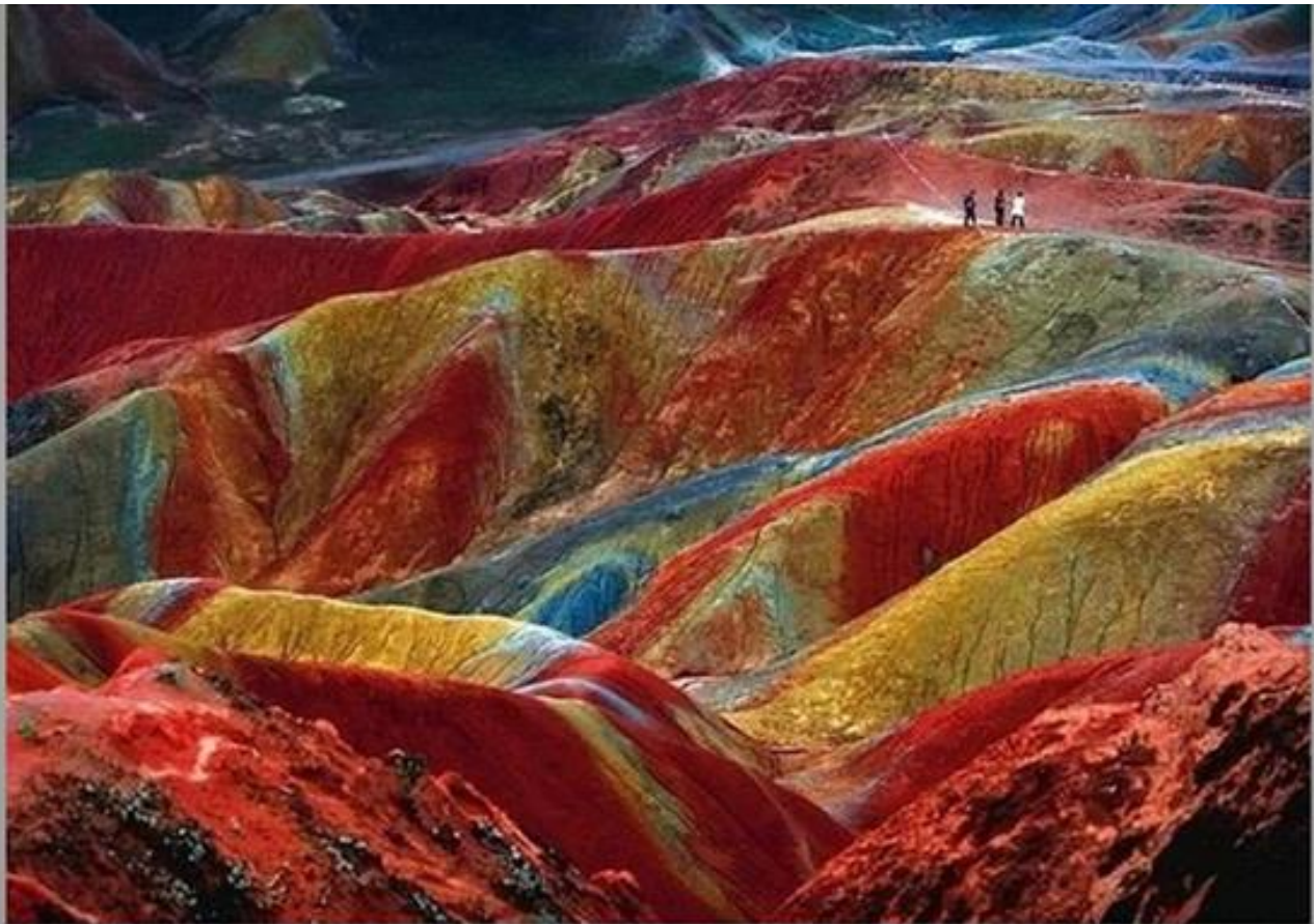
This is a unique geological phenomenon known as Danxia landform. These phenomena can be observed in several places in China. This example is located in Zhangye, Province of Gansu. The color is the result of an accumulation for millions of years of red sandstone and other rocks.