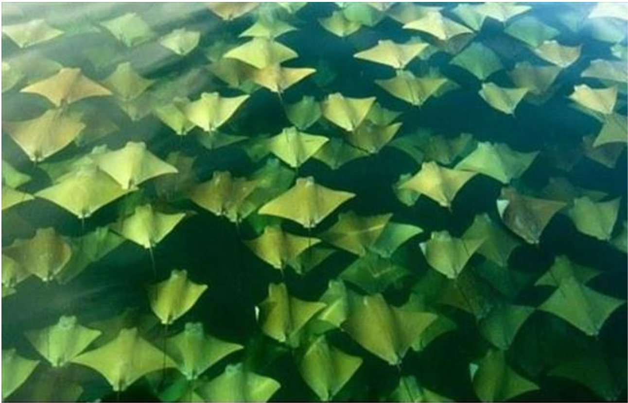
Twice a year in the Gulf of Mexico rays migrate. About 10 thousand stingrays swim from the Yucatan Peninsula to Florida in the spring and back in the fall.