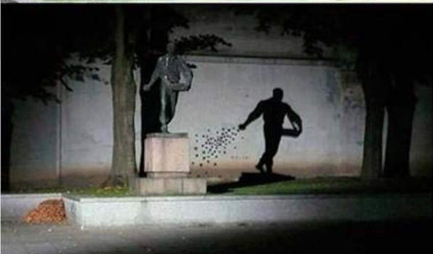
Day and night. The monument in Kaunas, Lithuania