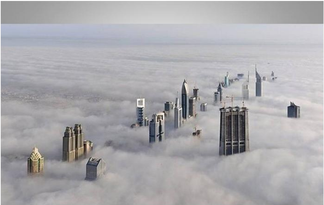
Dubai. The view from the skyscraper BurjKhalifa. The height of buildings is 828 m (163 floors).