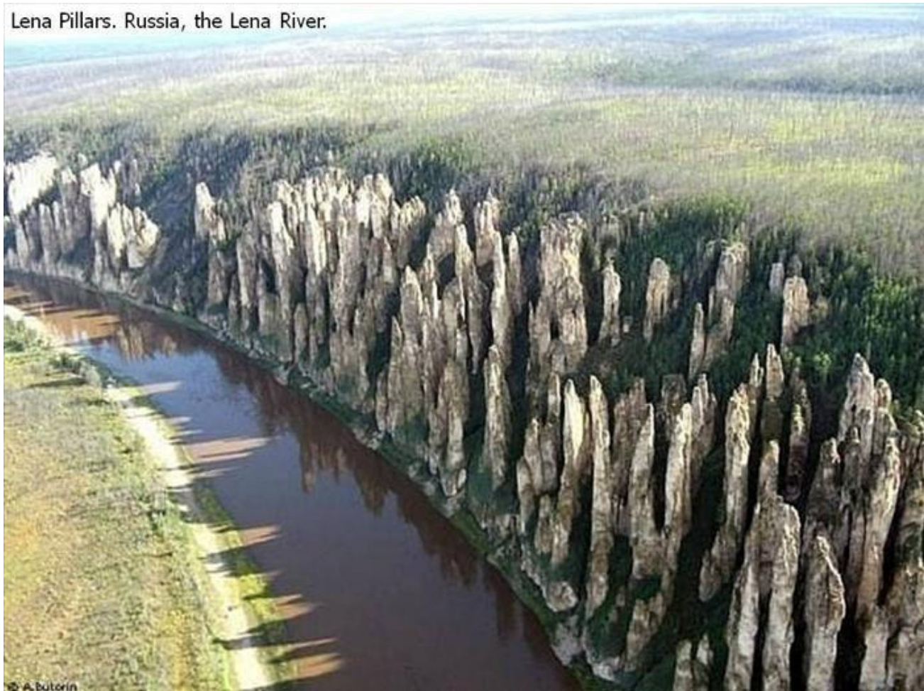
Lena Pillars. Russia, the Lena River.