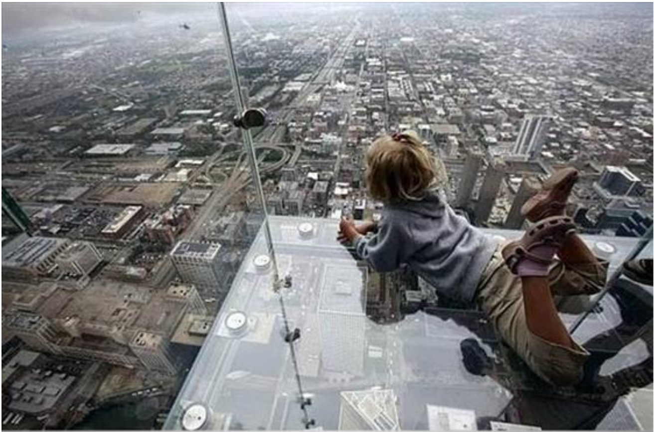
Balcony of floor 103 in Chicago.