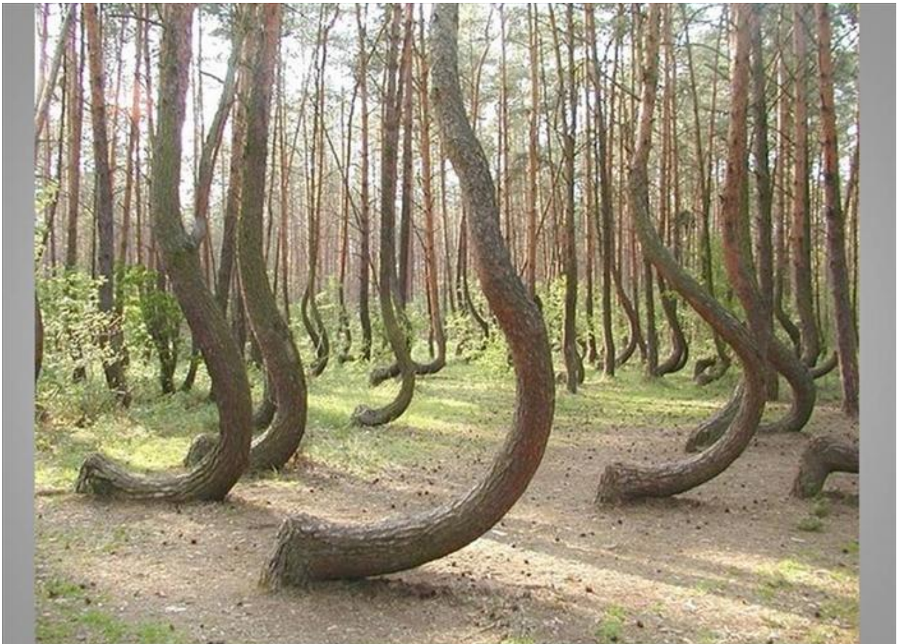
These trees grow in the forest near Gryfino, Poland. The cause of the curvature is unknown.