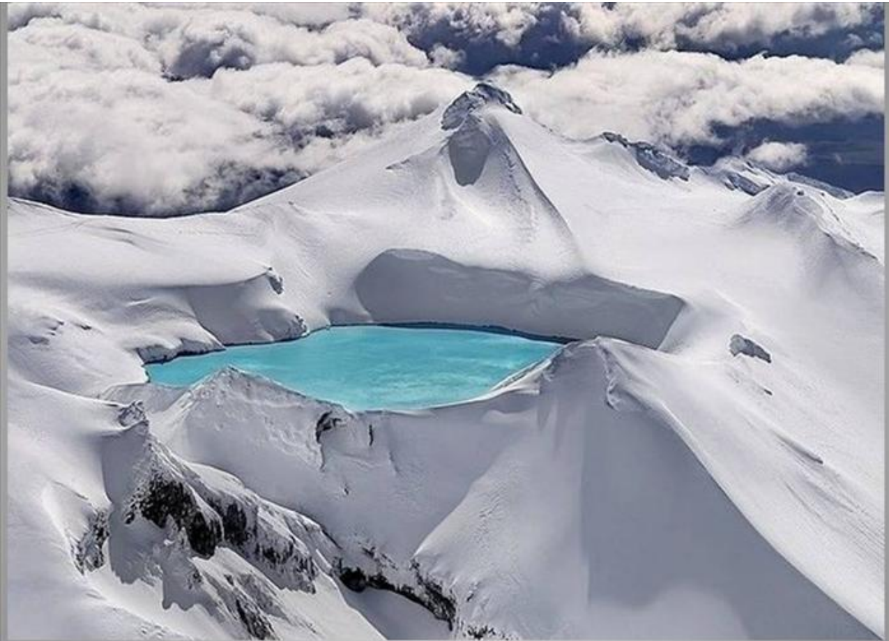
Emerald Lake in the crater of an extinct volcano. Tongariro National Park - New Zealand