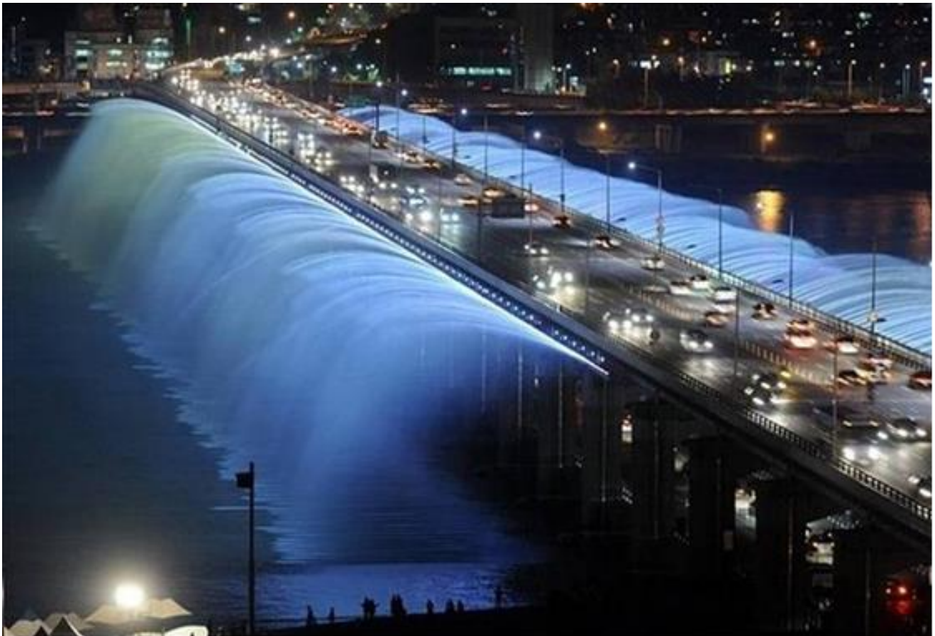
Banpo Bridge in Seoul, South Korea