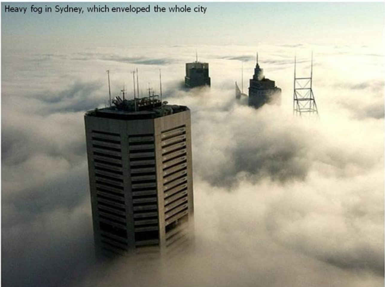
Heavy fog in Sydney, which enveloped the whole city