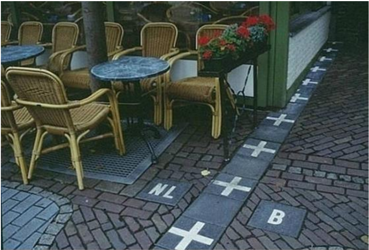
The border between Belgium and the Netherlands in a café.