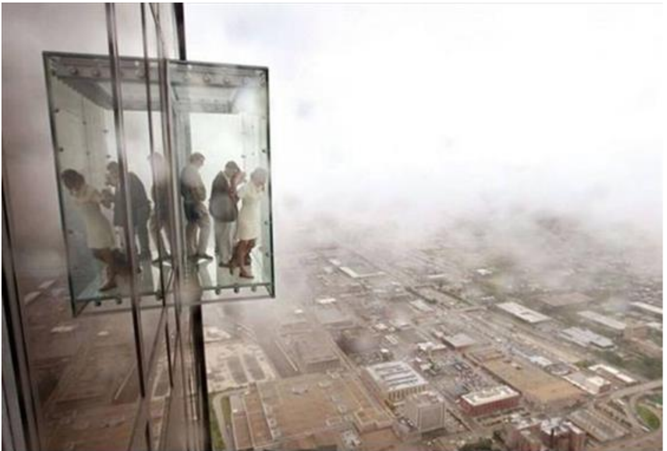
From the outside it looks like