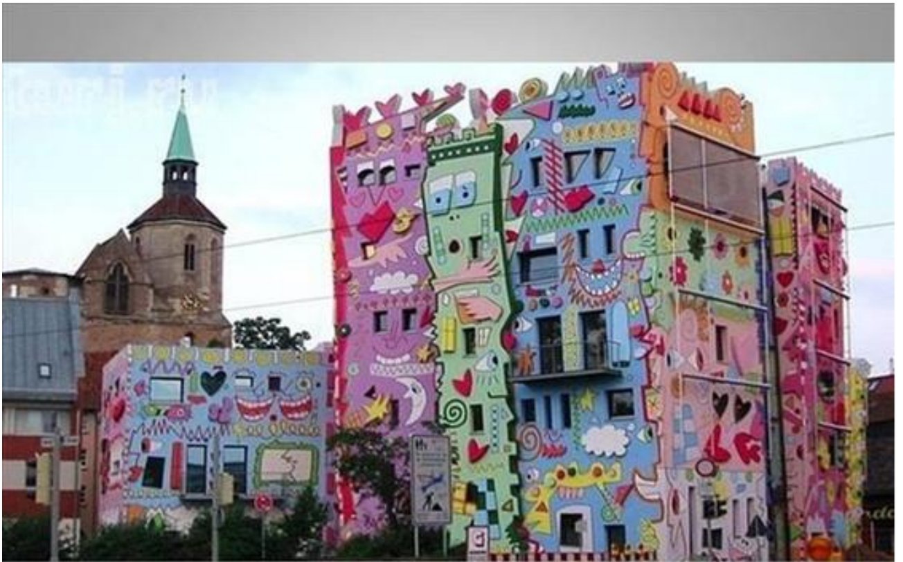
Haus Rizzi - Germany.