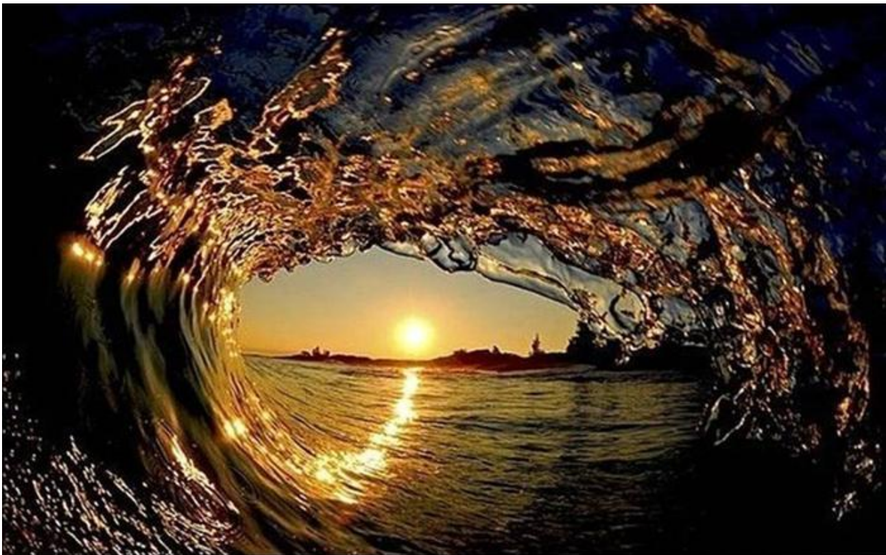
View of the sunset from inside the wave.