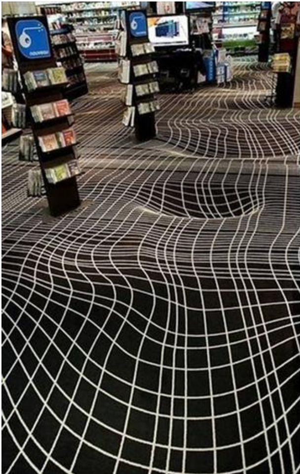
Paris computer games store. In fact, the floor is absolutely flat.