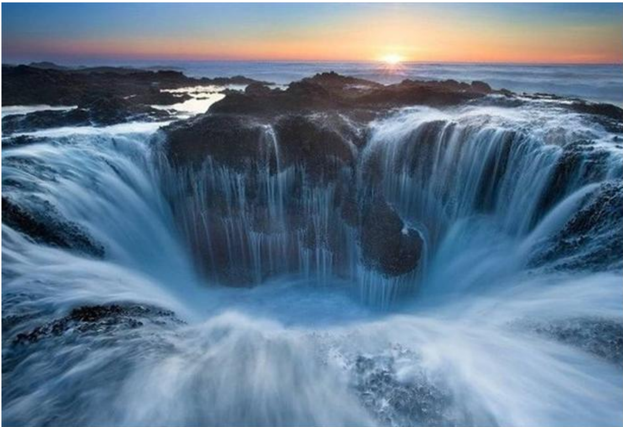
Thor's Well a/k/a "the gates of the dungeon" on Cape Perpetua, Oregon. At moderate tide and strong surf, flowing water creates a fantastic landscape