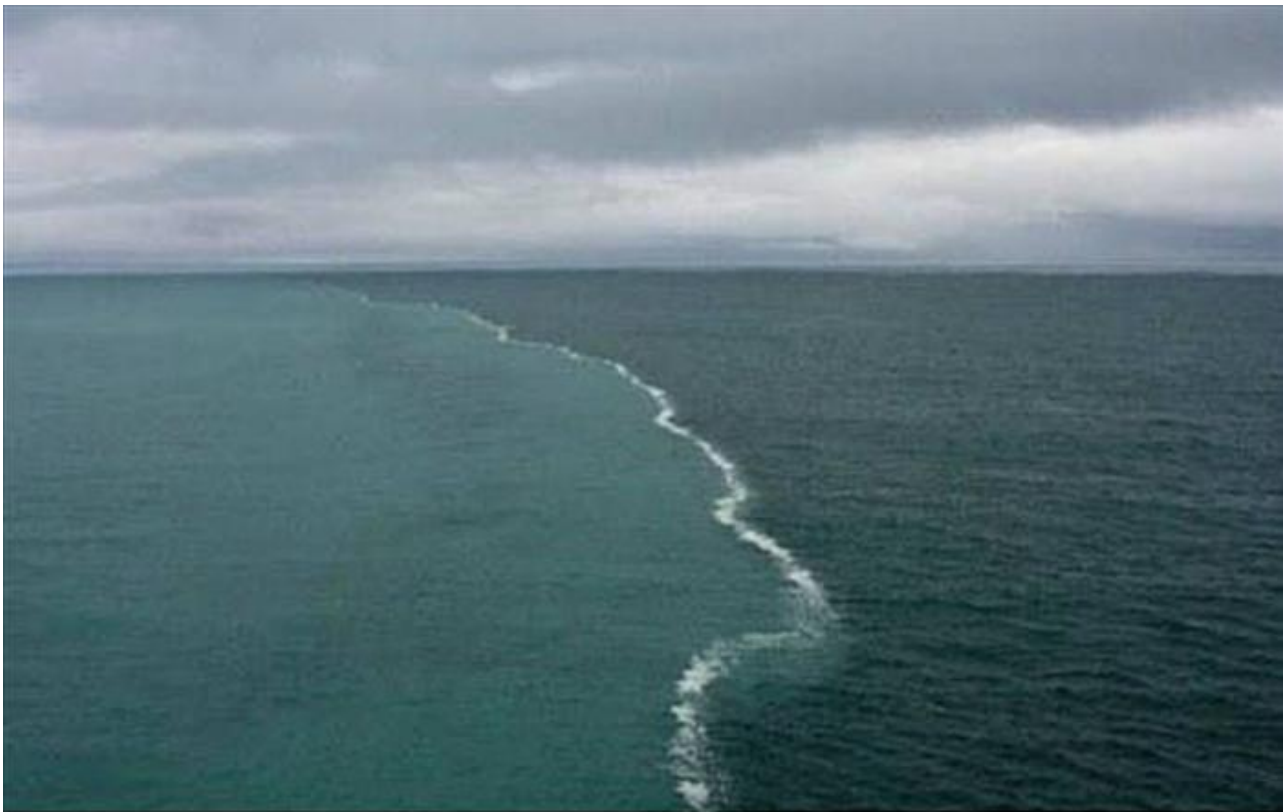
In the resort town of Skagen you can watch an amazing natural phenomenon. This city is the northernmost point of Denmark, where the Baltic and North Seas meet. The two opposing tides in this place can not merge because they have different densities.