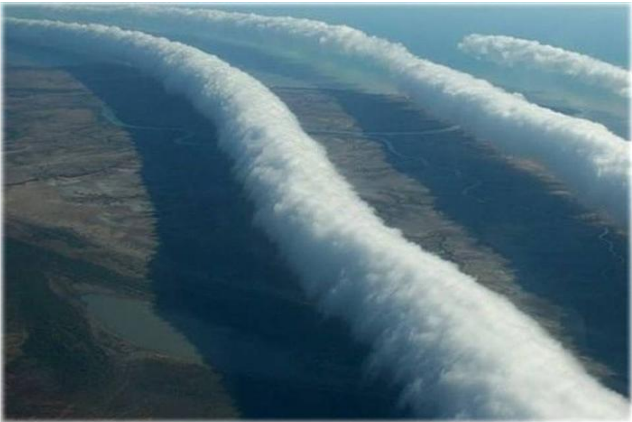
Morning Glory - kind of clouds observed in the Gulf of Carpentaria in northern Australia