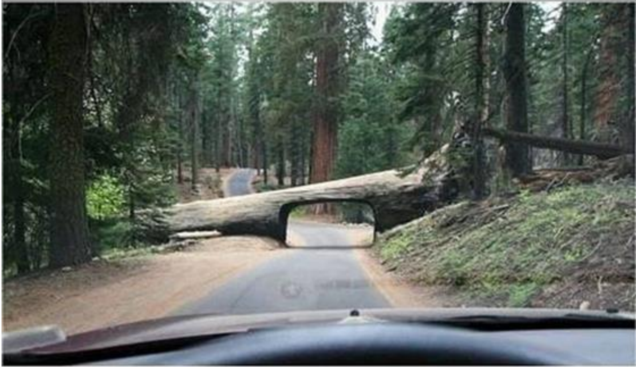
An unusual tunnel in California's Sequoia National Park