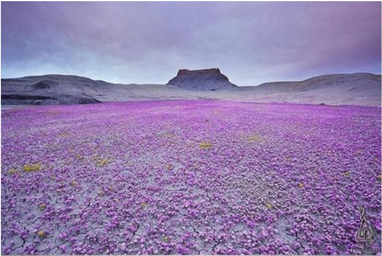
Desert with Phacelia (Scorpion Weed). Flowering once in several years.