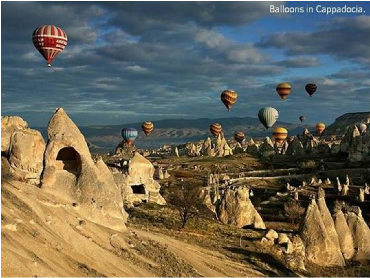
Balloons in Cappadocia.