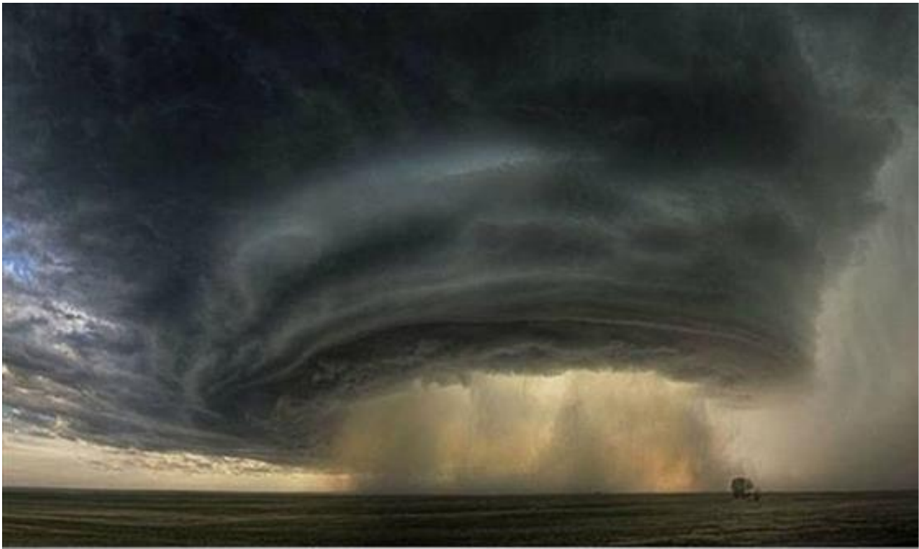
Photo of storm in Montana, USA, 2010