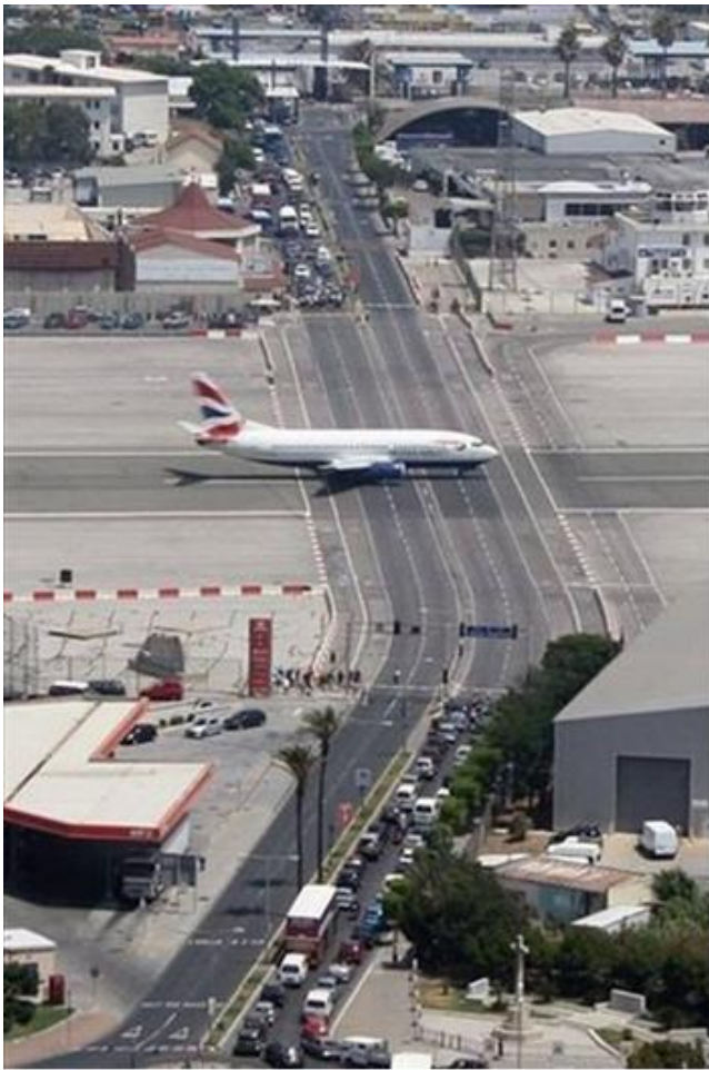
Gibraltar Airport is one of the most extraordinary airports around the world